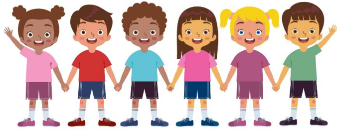
children in action & mission friends

The Children in Action/Mission Friends and Young Adult Bible study for May will be on May 5. We will have lunch after worship and the children will visit Babcock Manor to deliver cards and sing. The parents will have their usual study time together. Please mark your calendar since this is a change in time and first Sunday.